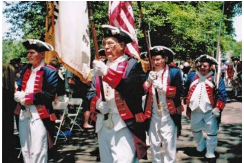
(Left and Above) Members of Louisville-Thruston's Dr. V. Edward Masters Memorial Color Guard marched at the Memorial Day ceremonies at Zachary Taylor National Cemetery - May 30, 2011.