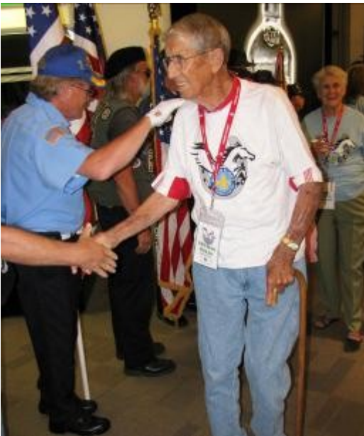
Photos taken at the D-Day Anniversary Honor Flight at Louisville International Airport on June 6, 2011

For those of you who may not be familiar with the program, Honor Flight is a national, non-profit organization created as a way to honor American veterans for their sacrifices and achievements by flying them at no cost to Washington D.C. to visit and reflect at their memorials. Top priority is given to senior veterans—World War II survivors along with those veterans of all wars who may be terminally ill. Sadly, we are losing over 1200 WW II veterans each day.