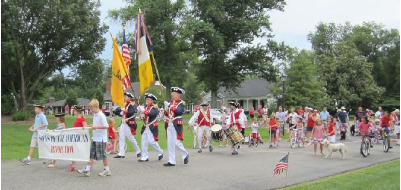
Americana was on display at the Independence Day Parade in the Robinswood section of Louisville on July 4, 2011. Fire trucks led the procession, a band played patriotic music, and the L. T. Color Guard fired muskets to close the proceedings.