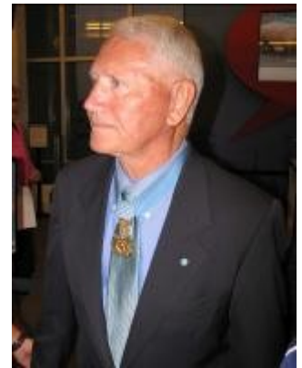
Among those welcoming the vets was Col. (U.S.A.F. Ret.) Leo K. Thorsness , awarded the Congressional Medal of Honor for his actions in Vietnam.

The local Bluegrass Chapter of Honor Flight, which serves veterans of the bluegrass region, is based in Louisville, Kentucky and sponsors several flights to Washington D.C. each year. Everyone is encouraged to join us for future Honor Flight events. It's an emotional and rewarding experience for both veterans and those assembled to greet them. Dates and times will be posted in the Upcoming Events section of our web site.